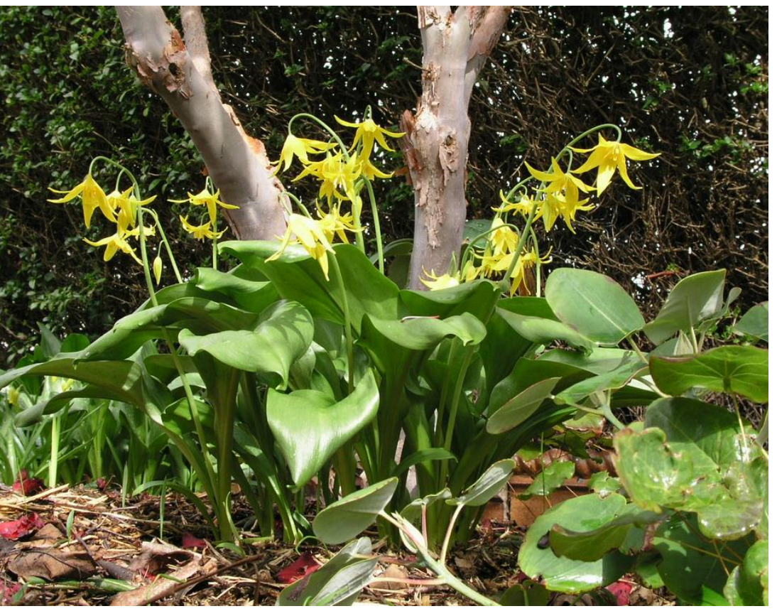
Erythronium tuolumnense growing under Rhododendron thomsonii

If your garden is likely to have hot sunshine when the Erythronium are in growth then some shade from the mid-day sun would be desirable to prevent the ones particularly with broad leaves from being scorched. Their relatively soft leaf structure indicates to us that they need some shelter from strong winds which at their worst can shred and snap the leaves and flowering stem so those species with the larger leaves such as Erythronium tuolumnense and its hybrids need more shelter than smaller growing species.