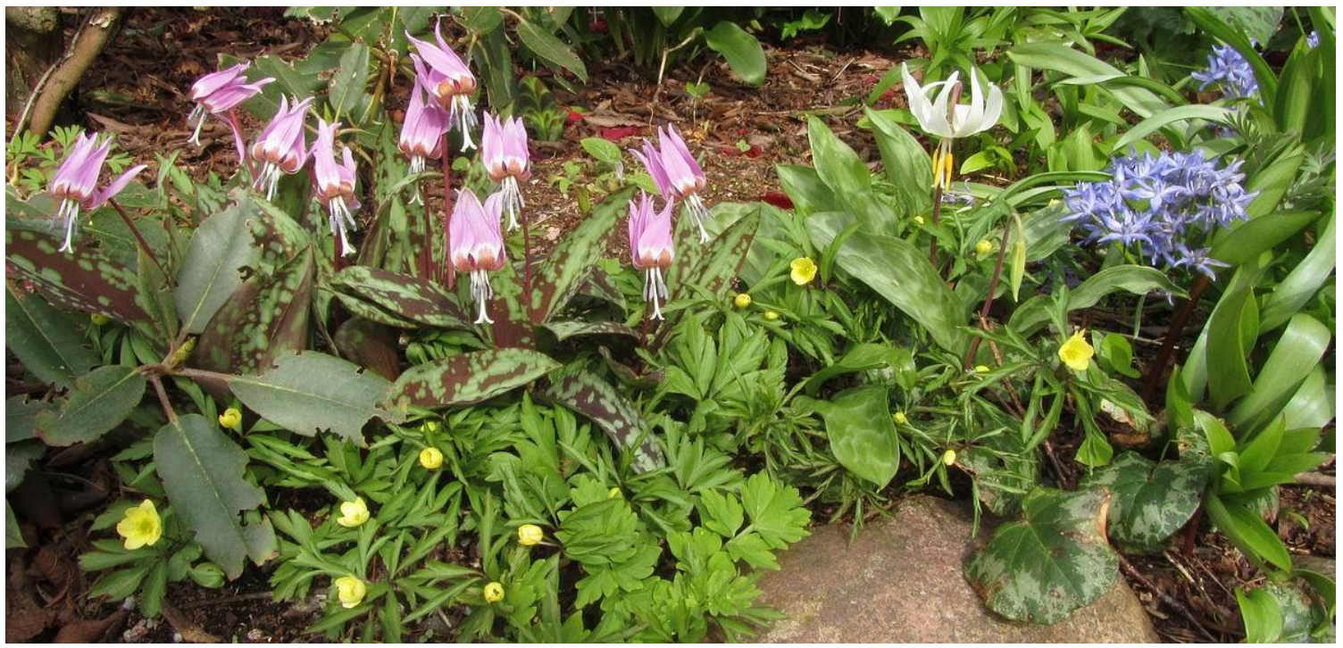
Erythronium dens-canis with other low-growing spring bulbs.