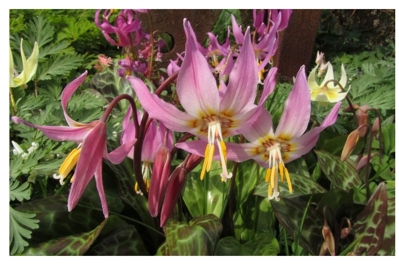
An open pollinated hybrid between Erythronium revolutum and 'White Beauty'

I much prefer to group plants in communities rather than having a clump of a single plant surrounded by bare ground. In nature plants rarely grow in isolation and this more natural style of planting looks much better. In addition the plants become a supportive community forming a beneficial environment