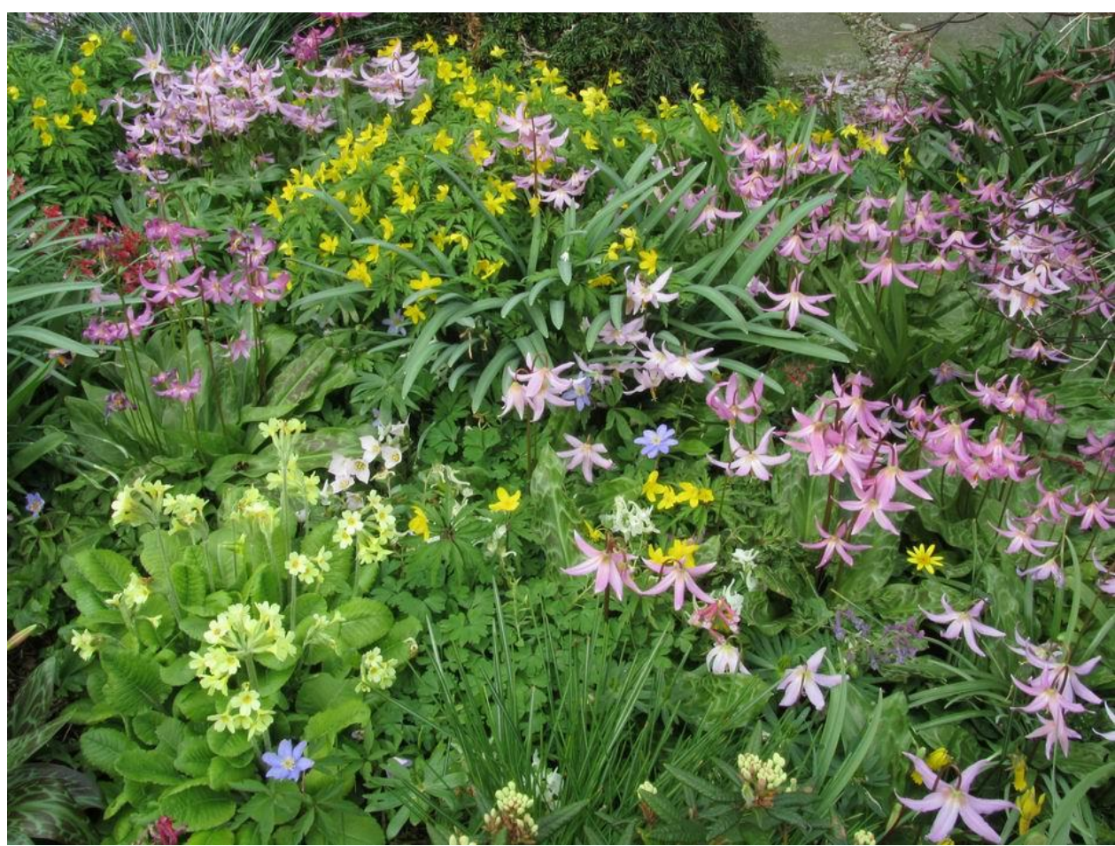
The pink Erythronium revolutum greatly extends the flowering season in one of our early spring beds picking up the flowering interest from Eranthis, Galanthus, and flowering happily through Corydalis solida and Anemone ranunculoides.

Erythronium japonicum is a very beautiful species which, since getting a few bulbs some years ago, we have been raising from seed, collected from these few plants, this both builds up our numbers as well as helping to acclimatise them to our growing conditions