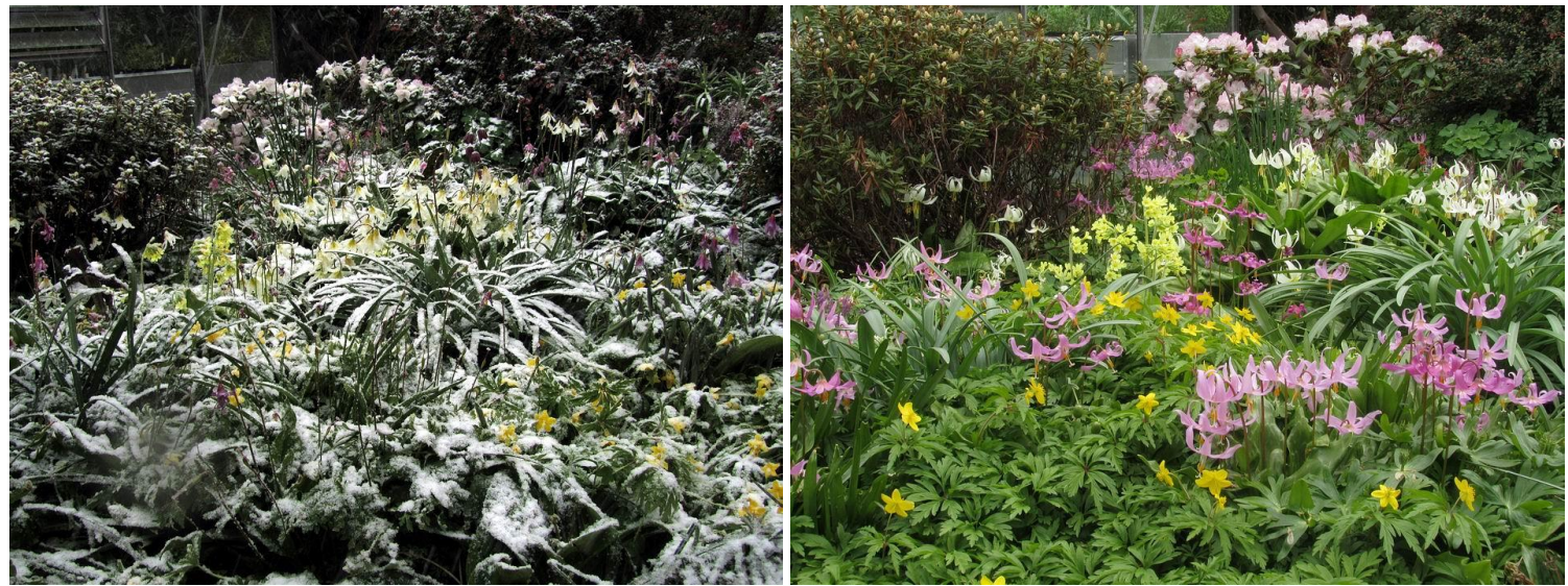
We can get snow when the Erythroniums are in flower but as you can see within a day or two the snow has melted and the plants sit back up, undamaged. A prolonged cold spell and/or wet conditions when the plants are in flower will greatly reduce the amount of seed we can get.

One of my own hybrids with Erythronium helenae as the seed parent is Erythronium 'Craigton Cream': the clump shown above has formed from a single bulb in just two years' of growth.